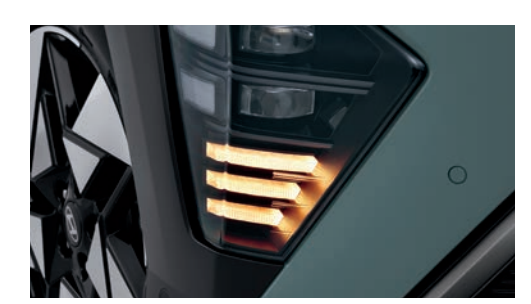
LED turn signal indicators (front/rear)