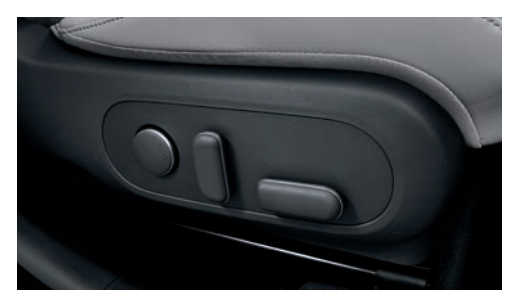
Powered driver seat