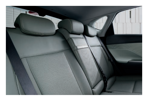
2nd-row seatback 2-step latch