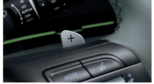
Paddle shifters* *Only available in KONA Hybrid