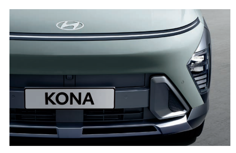
Front seamless horizon lamp, front bumper* * Only available in Kona N Line model