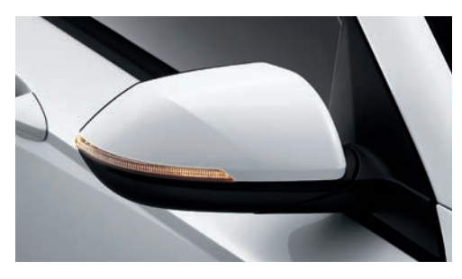
Outside mirror (Heated / Folding / Turn signal indicator LED)