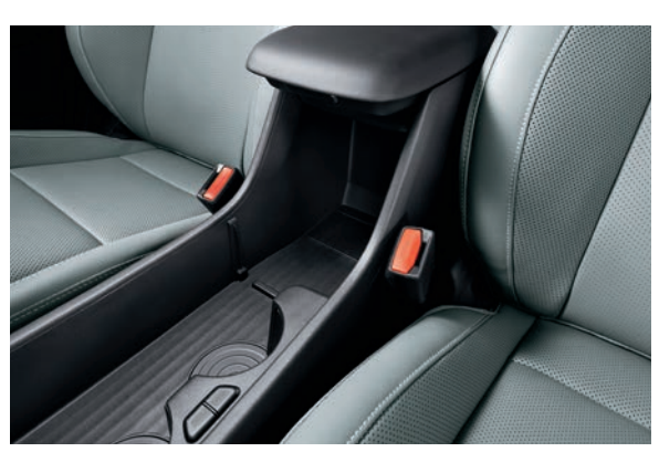
Open console storage (removable bulkhead / rotational cup holders)