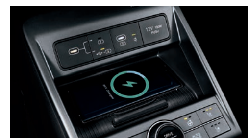
USB-C Data/Charging ports/Wireless charging pad* *Wireless charging pad only available in Elegance model upwards

* Features and specifications may vary by market and are subject to change. Please consult your local dealer. 25