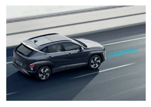
Lane Following Assist (LFA) Lane Following Assist (LFA) helps center the vehicle in the lane.