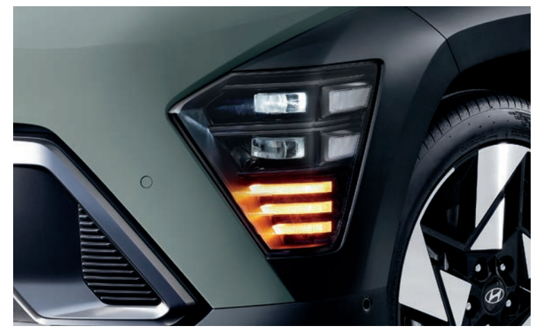
Full LED headlamps (projection type)