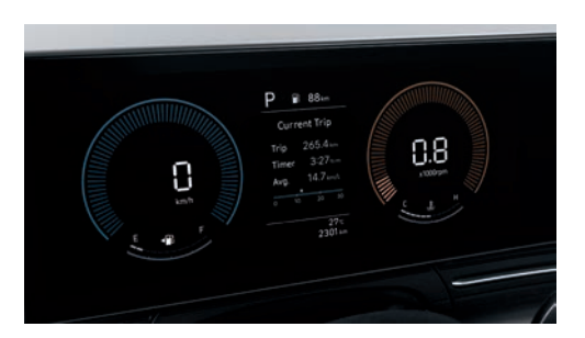
Cluster display (4-inch color LCD)* *Only available in Signature model