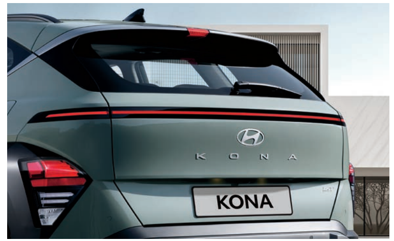
Spoiler Integrated HMSL, rear seamless horizon lamp LED brake lamps, LED turn signal lamps