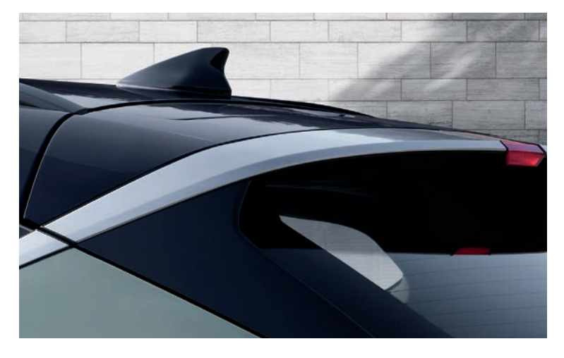
Dual tone roof, sharp connecting chrome line