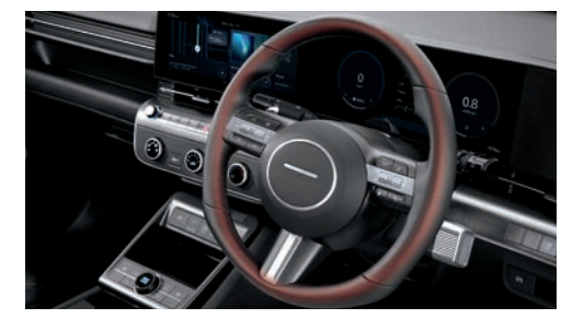
Heated steering wheel *Only available in Elegance model upwards