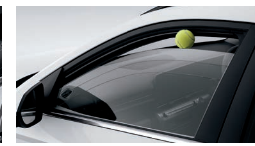
Safety power window