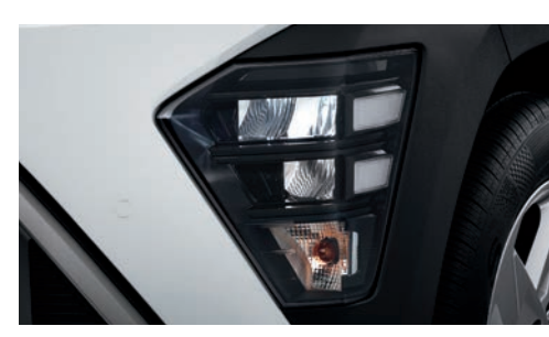
LED Headlamps (MFR)