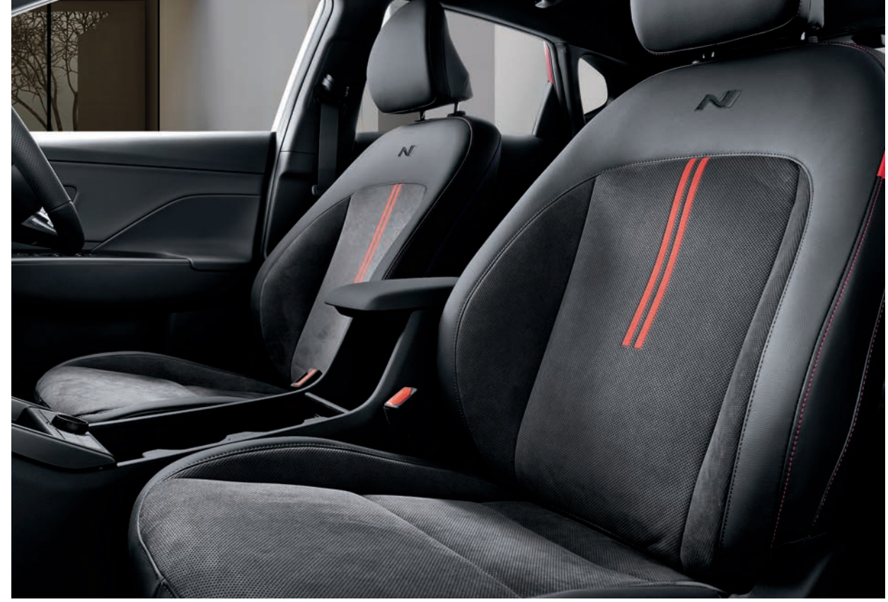
N Line - exclusive seats *All images shown are for reference only

N Line-exclusive 18-Inch alloy wheels / Body-colored cladding