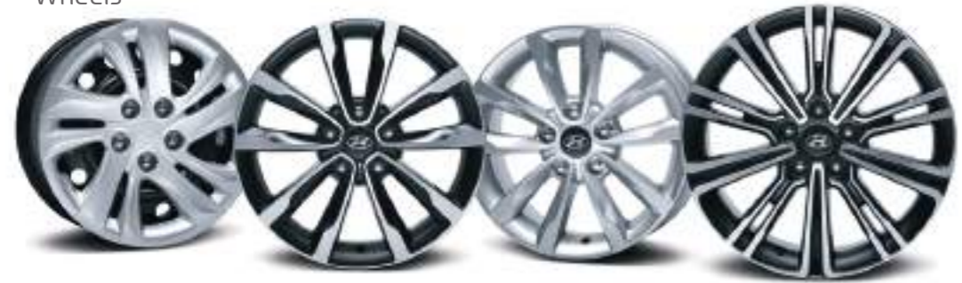
16" Steel Wheels 17" Alloy Wheels 16" Alloy Wheels* 18" Alloy Wheels*

*16" and 18" Alloys available as an option