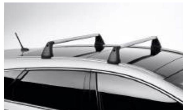
Roof Rack, Aluminium & ProRide Bike Carrier. This robust but light-weight roof rack provides a secure platform for a range of roof carriers. The ProRide bike carrier has a quick-mount system with a self-adjusting frame holder that allows a convenient wheel securing.