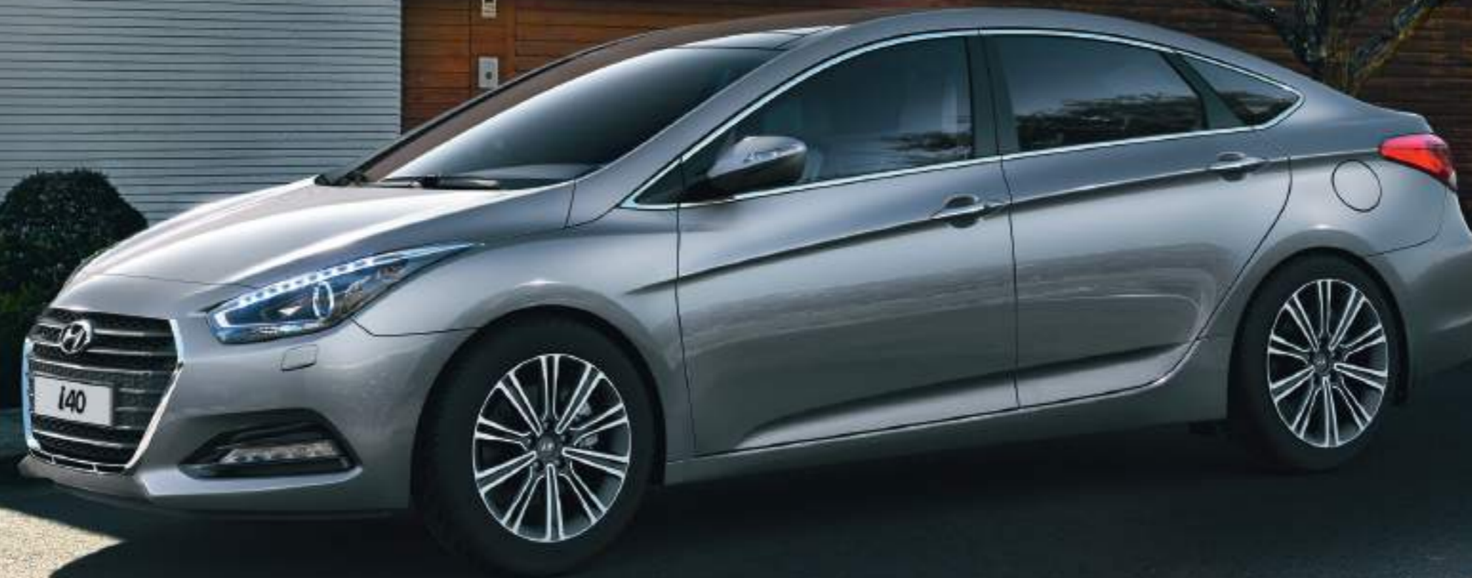
Image for illustrative purposes only, please contact your main Hyundai dealer for more information.

But looks aren't everything. This new i40 also comes with significant functional and technological upgrades that enhance the total driving and ownership experience.