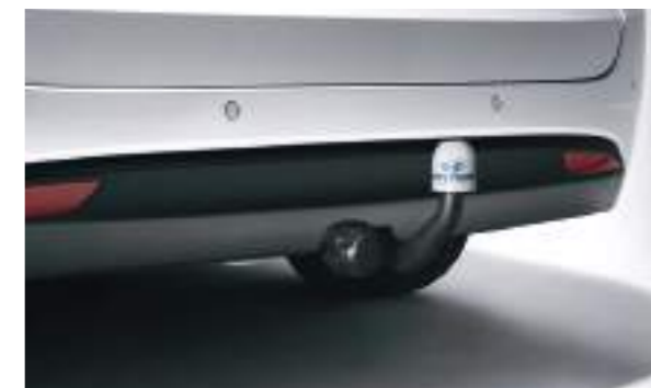
Fixed Towbar. Ideal for regular use, this fixed tow bar features a high-quality corrosion-resistant coating.