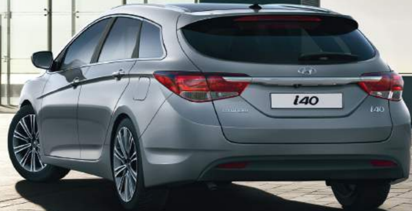
Image for illustrative purposes only, please contact your main Hyundai dealer for more information.