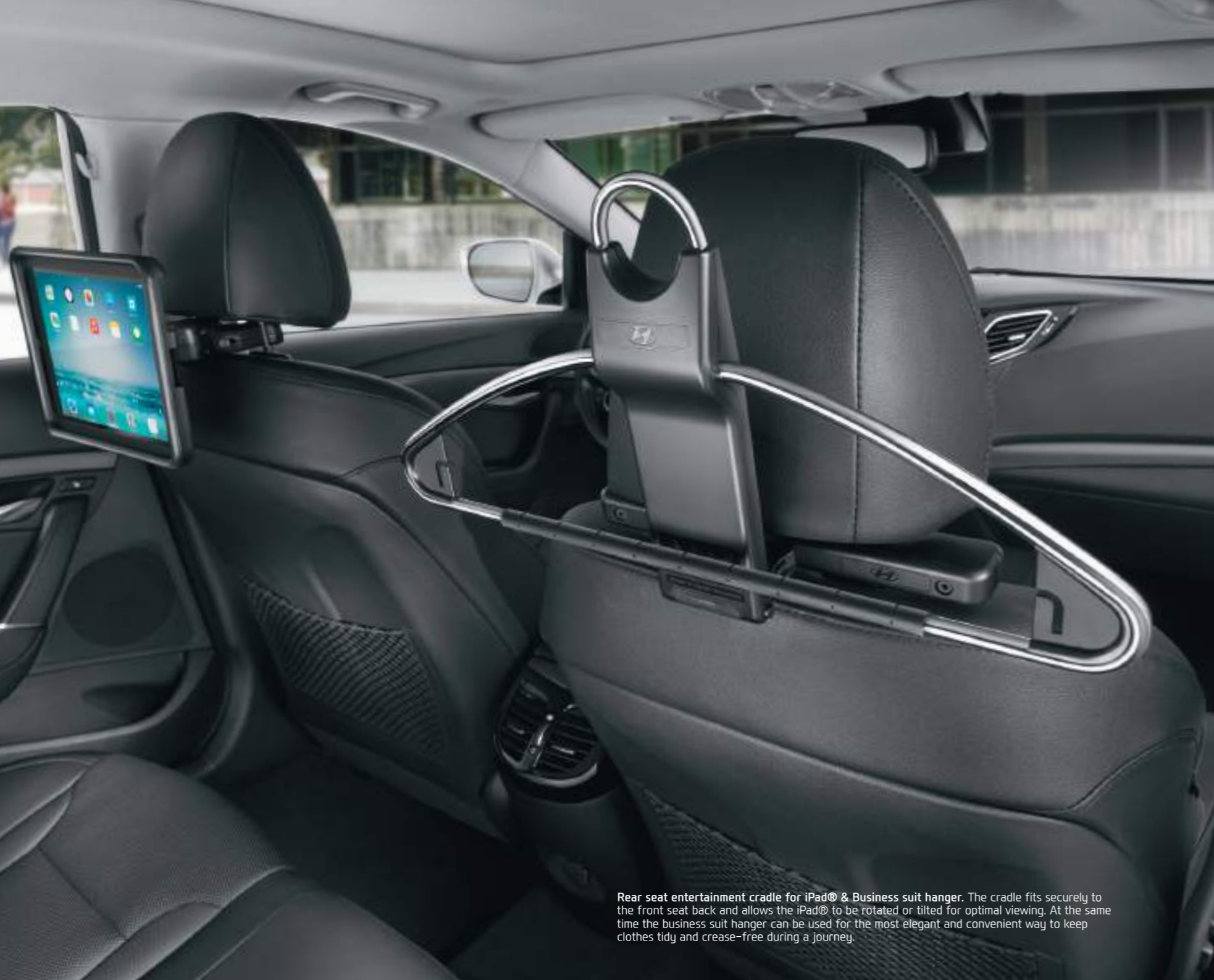
Rear seat entertainment cradle for iPad® & Business suit hanger. The cradle fits securely to the front seat back and allows the iPad® to be rotated or tilted for optimal viewing. At the same time the business suit hanger can be used for the most elegant and convenient way to keep clothes tidy and crease-free during a journey.