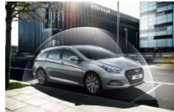
Hyundai Glasscoat. Protecting your car inside and out has never been easier with Hyundai Glasscoat paint, alloy wheel and fabric protection package. Your vehicle will retain that showroom finish long after you've driven off the forecourt.

Hyundai Genuine Accessories have been created to help you enjoy even more fun and versatility with your new i40. All are precision-made using high quality materials, so that they will fit your car perfectly. And they meet the rigorous manufacturing standards demanded of all products carrying the Hyundai name.