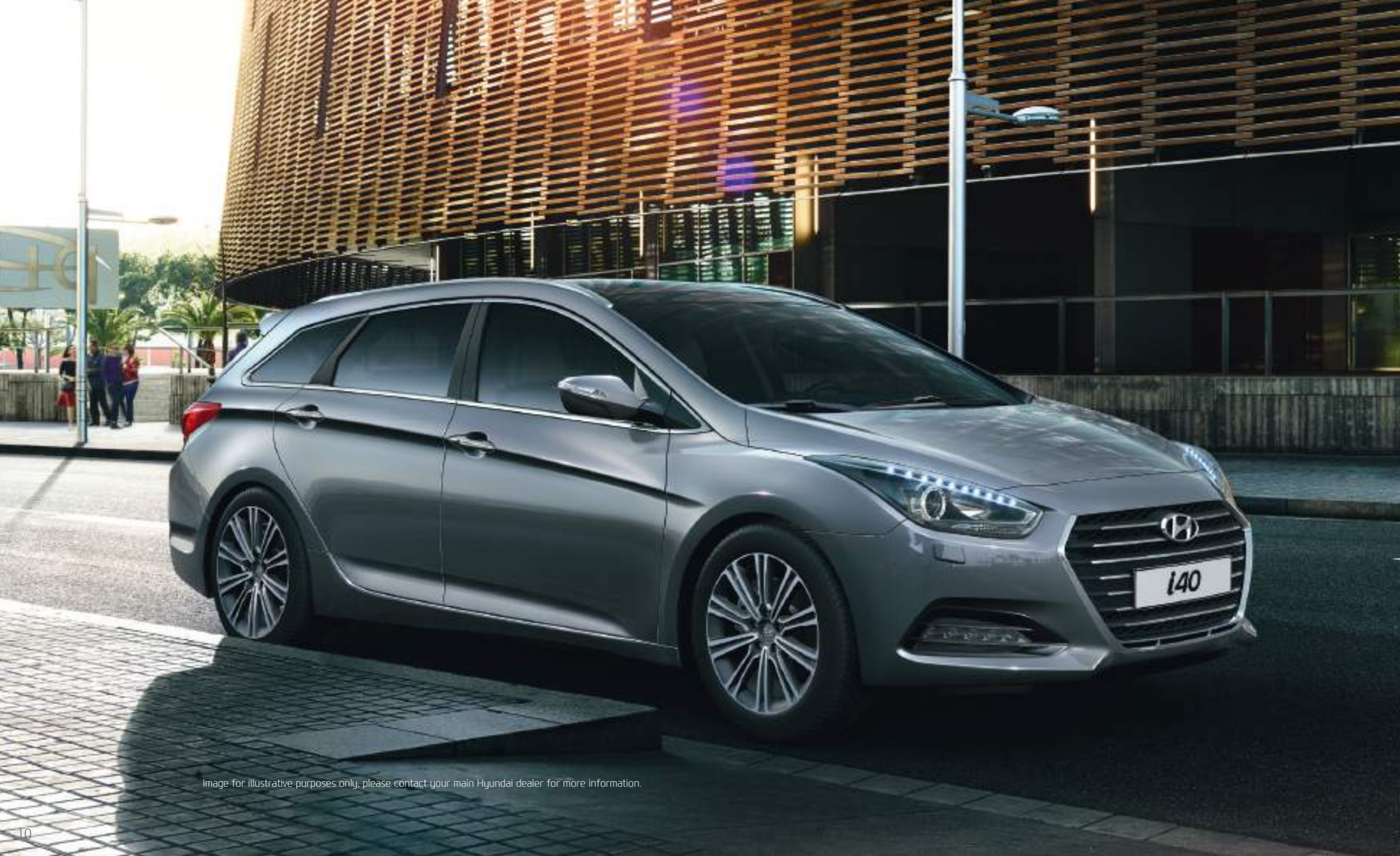
Image for illustrative purposes only, please contact your main Hyundai dealer for more information.