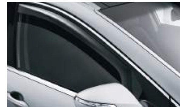
Wind Deflectors. Reduces turbulence when driving with a slightly open front window. The aerodynamically formed deflector redirects the airflow and deflects the raindrops.