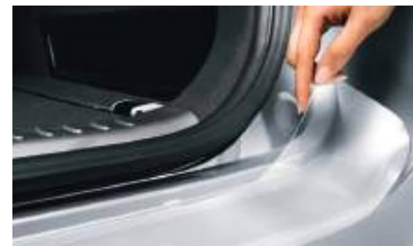
Rear Bumper Protection Foil, Transparent. Resilient, transparent protective foil for the top surface of your car's rear bumper. Prevents damage to the painted surface while loading and unloading.