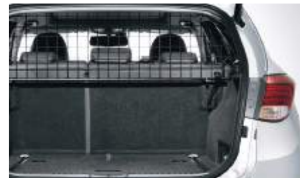
Cargo Separator. Fitting perfectly between the rear seatbacks and the roof, this robust product protects vehicle occupants from the movement of items in the trunk. The easy to install grid is designed not to restrict the driver's rearward view.