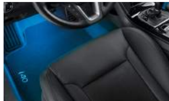
Textile Floor Mats, Velour & Blue LED Lighting Foot Area. High quality velour mats provide protection that keeps the interior looking clean and new. The LED lighting provides a welcome illumination that automatically switches on and off with the opening and closing of the front doors.